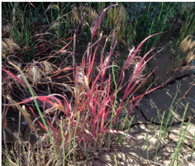
Figure 3. Weedy grass species can act as alternate hosts for the aphid vectors and barley yellow dwarf virus.

Often, field edges and the edges along center pivot tire tracks are most severely affected by the disease (figure 1). BYD incidence declines along a gradient toward the center of the field. Additional symptoms may include notching of the leaf margins, twisting, leaf tip scorch, and abnormal development of emerging leaves. Infected weedy grasses in nearby ditch banks, which act as alternate hosts for the virus and aphid vectors, may also exhibit yellowing or a very characteristic reddening of leaves (figure 3). Symptom development in the host plant is greatest at temperatures below 75°F (59°–65°F) and at high light intensity.