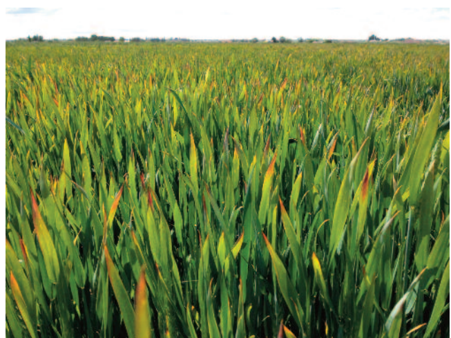
Figure 2. Stephens soft white winter wheat infected with barley yellow dwarf virus near Kimberly, Idaho, May 30, 2013.