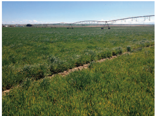
Figure 1. Winter barley infected with barley yellow dwarf virus, Burley area, May 1, 2013. Plants along center pivot tire tracks are often the most severely affected.

Symptom expression of the PAV strain of BYDV can vary widely. The most characteristic symptom is yellowing and/or reddening of leaves (figure 2) starting at the leaf tip and moving toward the base and inward from the margins. BYD-affected plants exhibit stunting of both foliar and root tissues. Affected plants produce relatively small, irregular heads. Seed size is also reduced, resulting in low test weight.